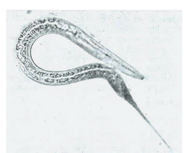
Plate 1(b). Third stage larva of H. contortus showing mild surface reactivity with B. trigonocephalum hyperimmune sera

in the present study. IPA dose not require an expensive fluorescent microscope and ordinary compound microscope would be sufficient. The stained slides can be visualized and the results can be read at any time after performing the test. Whereas, IFAT results need to be read immediately after performing the assay since the fluorescence of the fluorochrome will quench with time. Above all, in case of immunoperoxidase assay (IPA), it is possible to keep a permanent record of the reaction by preserving the slides, as the colour developed is very stable at room temperature.